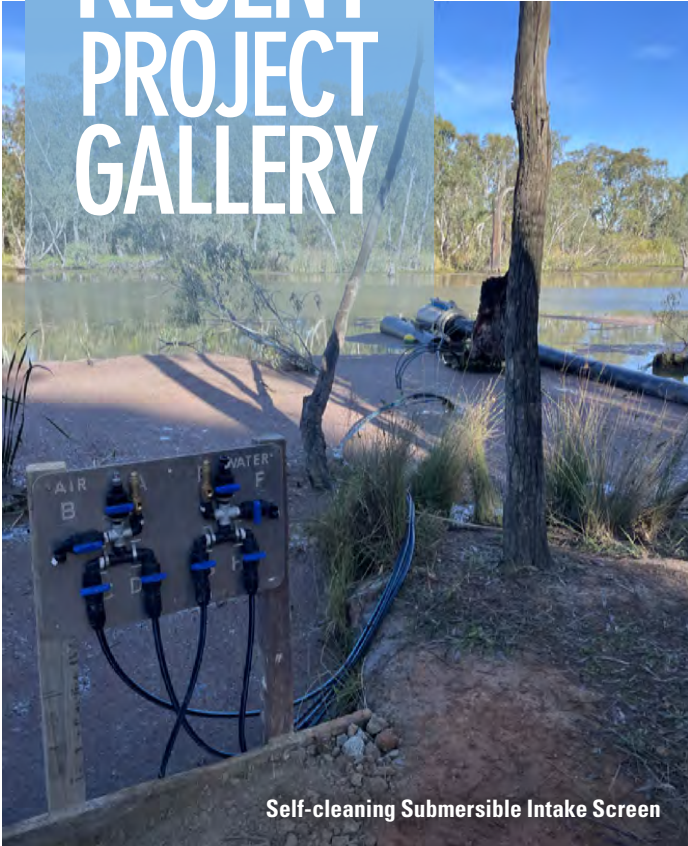
Self-cleaning Submersible Intake Screen