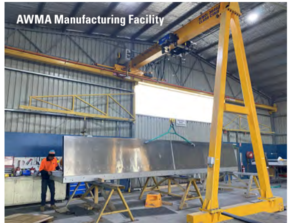
AWMA Manufacturing Facility