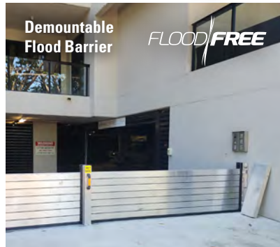
Demountable Flood Barrier