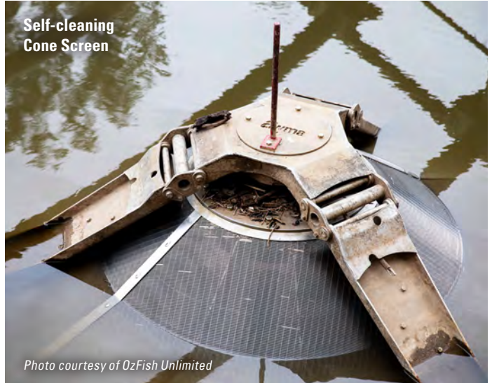
Self-cleaning Cone Screen